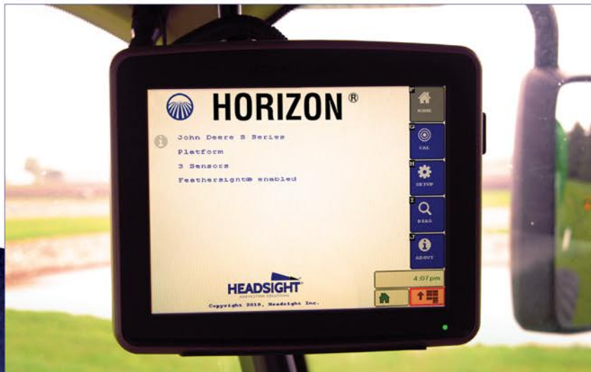
Virtual Terminal Interface

"We were very happy with the added lateral tilt performance, when opening fields, going through steep coulees and cutting out waterways."