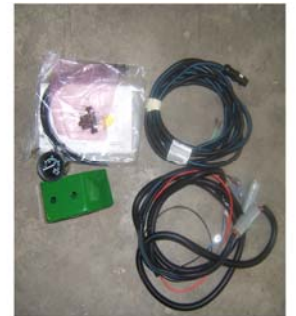
600F Pressure Gauge for CIH combine